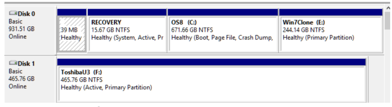
Disk 1 is a Toshiba USB 3 external hard drive.